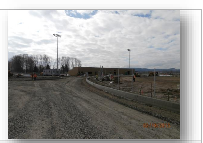
Curb and road base construction NW parking area