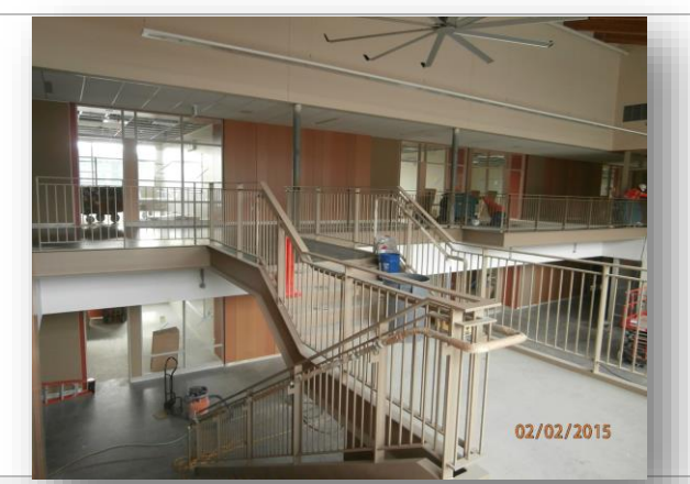
South Shared Activity Area