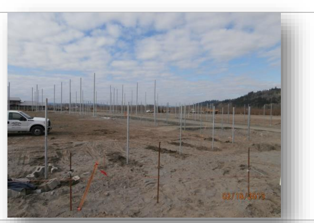
Baseball and Softball fencing